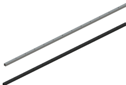
Cable Braces For supporting cables between posts Level and Stair braces available