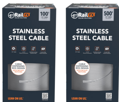
100' and 500' Cable 1/8" Bulk cable for use with FlexFX Fittings