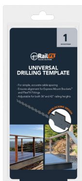
Universal Drilling Template For accurate alignment and spacing